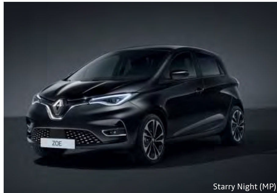
Starry Night (MP)