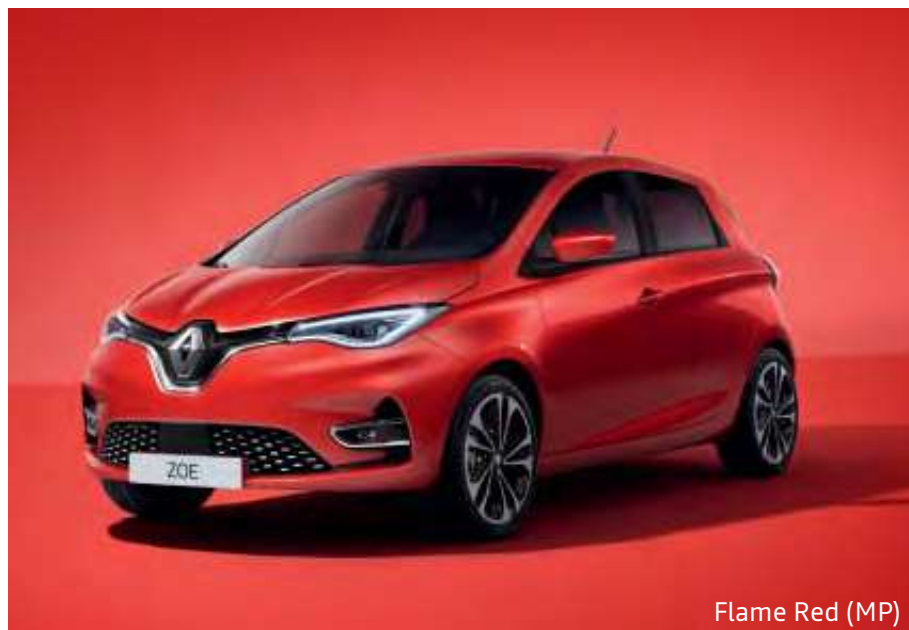
Flame Red (MP)

MP: Metallic Paint - CO: Clearcoat Opaque - Photos not contractually binding.