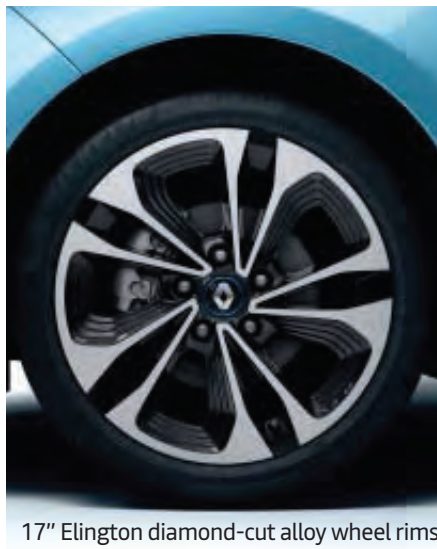
17" Elington diamond-cut alloy wheel rims