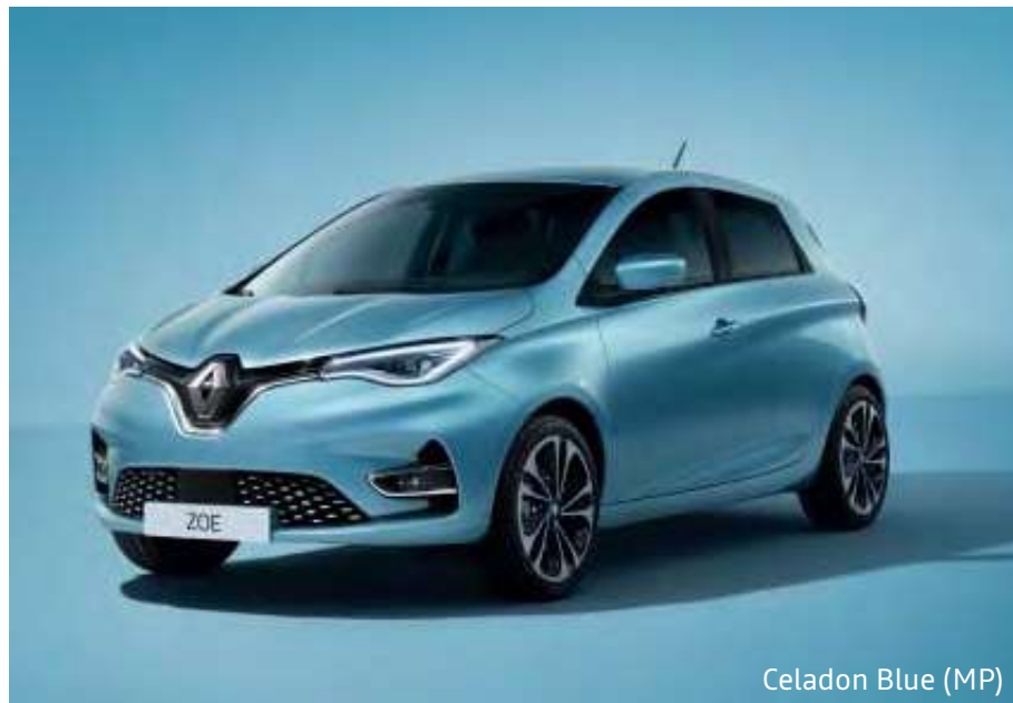
Celadon Blue (MP)